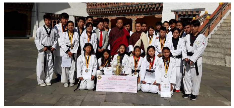
Chhukha Dzongkhag wins National Taekwondo Championship for seventh time.